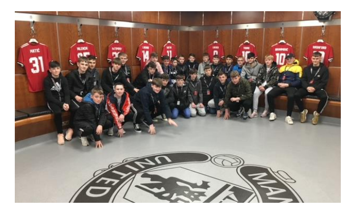
Pupils in the Manchester Utd Dressing Room

The visit to Manchester was also supported by the Manchester United Community Trust and pupils attended Premiership games involving Burnley, Stoke, Bournemouth and Manchester United. Pupils also participated in the Manchester United Learner Experience. This involved a detailed Stadium tour giving our pupils an insight into the wider aspects of running a multimillion pound business and events operation. As well as this tour pupils visited the Manchester United Museum and participated in a workshop in Manchester United's dedicated learning zone.