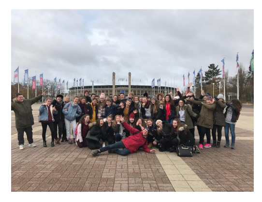
Vision Schools – level 1

For the fourth year in a row S3 pupils from Grove visited Berlin. The visit was a collaboration with Modern Languages and RMPE. During our time there the 46 pupils visited: the DDR museum, the TV Tower, the Jewish Museum, the Olympic stadium, Sachsenhausen Museum and Memorial, the Brandenburg Gate, Story of Berlin Museum, the Reichstag, the Berlin Wall, many Christmas markets and too many restaurants in THREE DAYS!!!!